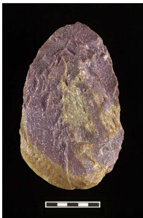
Fig. 3. Frontal surface view of the handaxe found at Sima de los Huesos (Atapuerca, Spain).

Sima de los Huesos has yielded a single lithic item: a finely flaked handaxe on quartzite (Fig. 3), which again permits the scientific community to confirm a relation between H. heidelbergensis and Acheulean (or Mode-2) technology. This handaxe was made from a cobble of good quality, reddish-light brown veined quartzite. It weighs 685 g, measures 155 × 97 × 58 mm, has an amygdaloid shape, with one side flat and another convex. It seems to have been made by means of soft ham-