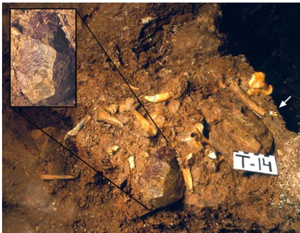
Fig. 2. Quartzite handaxe found at Sima de los Huesos (Atapuerca, Spain). For the first time, a tool has been found associated with remains of 28 individuals of H. heidelbergensis , who lived in Atapuerca at least 400 000 years ago. The white arrow points to a molar of a hominid (© Madrid Scientific Films).

Fig. 2. Hache de quartzite en provenance de Sima de los Huesos (Atapuerca, Espagne). Pour la première fois, un outil a été trouvé associé aux restes de 28 individus de H. heidelbergensis , qui vécurent à la Sierra Atapuerca, il y a au moins 400 000 ans. La flèche blanche indique une molaire d'hominidé (© Madrid Scientific Films).